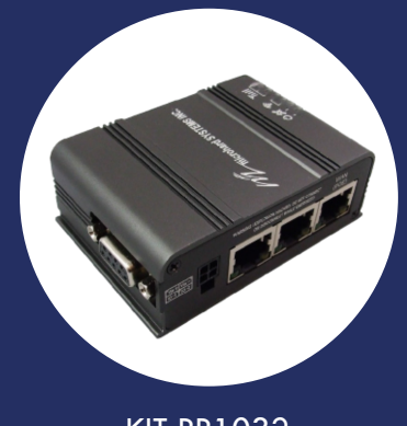
KIT-PR1032 Modem Bullet Plus